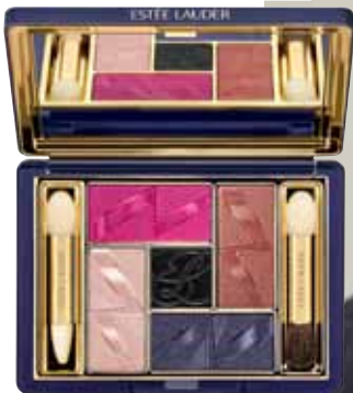
Pure Colour Eyeshadow Palette Violet Underground, £40, Estée Lauder, www.esteelauder.co.uk