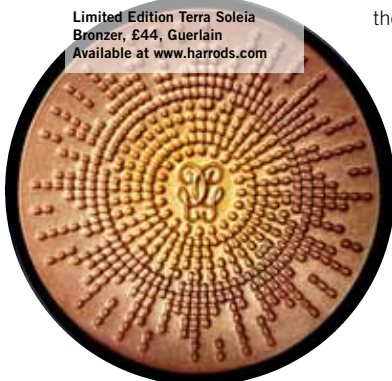
Limited Edition Terra Soleia Bronzer, £44, Guerlain Available at www.harrods.com