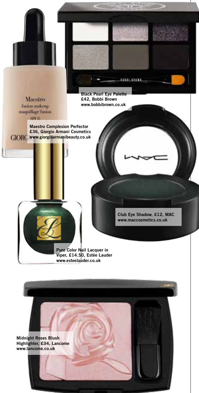
Black Pearl Eye Palette £42, Bobbi Brown www.bobbibrown.co.uk

Our round-up of the best beauty buys for 2012; stock up now!